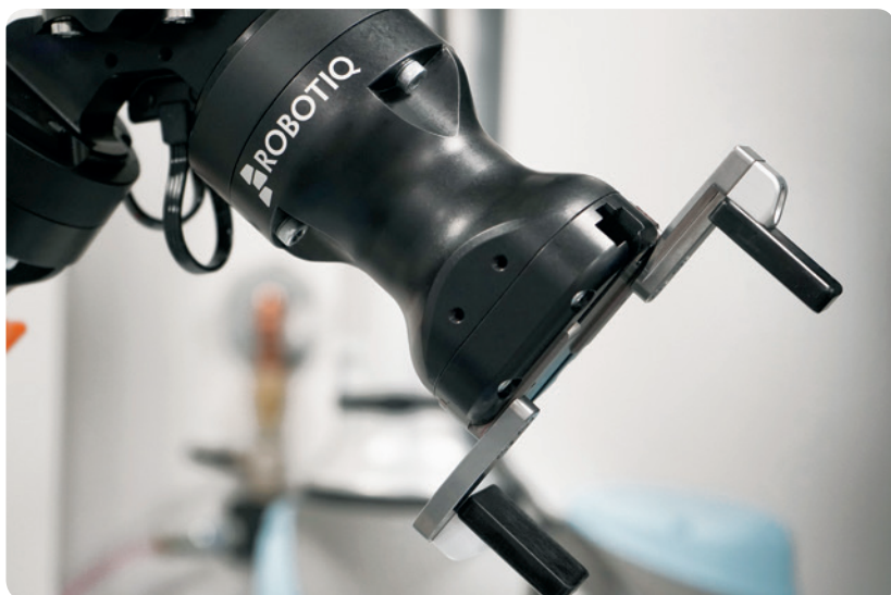
Extenders sold separately